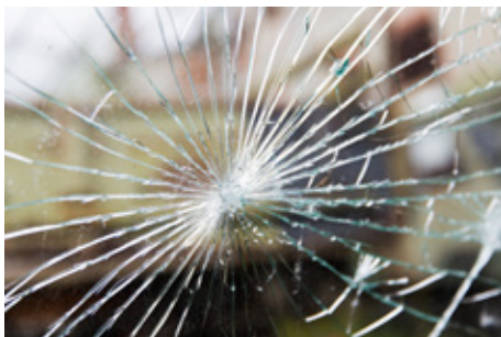
Broken annealed laminated glass

Its most significant feature is that if the glass fractures on impact, the fragments will remain bonded to the interlayer, minimising the risk of injury from flying glass, and maintaining the a protective barrier.